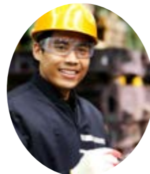
Supplying & Instalation