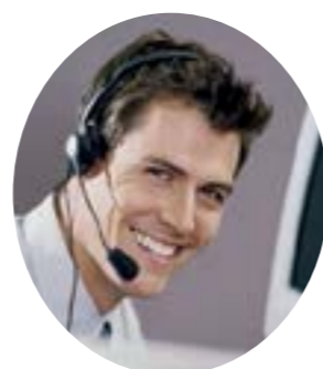
After Sales Services

Ferasa's mission is to be the best provider of fixed-point gas detection systems in Libya. We strive to provide the highest quality and best customer service – every customer, every transaction, every time.