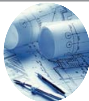
Engineering & Design

Emerged... as the most recent sister company in FERASA Group, comes with even broader activity range that spans all essential six oilfield technical. Its activities are integrated with the international arm of the Group, Ferasa Int'l Trading and Construction Co.Ltd. and Ferasa Tasharukia. Over the years... FERASA Int'l has acquired extensive business services that are growing steadily and what once a typically local supplier has become a company that regards the entire Libya and across the border as its market place. Today, FERASA represents partners from Europe serving around 300 clients worldwide. This trend is continuing and whenever a new project requiring oil & gas field technical services emerges FERASA is on hand. The company therefore places great emphasis of finding working partners and product suppliers abroad who can meet these important work standards. All these efforts invested to improve our quality of work are rewarded with satisfied customers who come back year after year.