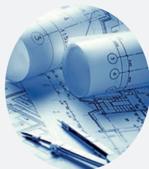
Engineering & Design

Emerged as the most recent sister company in FERASA Group , comes with even broader activity range that spans all essential six oilfield technical. Its activities are integrated with the international arm of the Group, Ferasa Int'l Trading and Construction Co. Ltd. and Ferasa Tasharukia. Over the years, FERASA Int'l has acquired extensive business services that are growing steadily and what once a typically local supplier has become a company that regards the entire Libya and across the border as its market place. Today, FERASA represents partners from Europe serving around 300 clients worldwide. This trend is continuing and whenever a new project requiring oil & gas field technical services emerges FERASA is on hand. The company therefore places great emphasis of finding working partners and product suppliers abroad who can meet these important work standards. All these efforts invested to improve our quality of work are rewarded with satisfied customers who come back year after year.