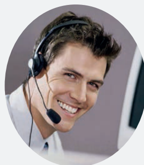
After Sale Services